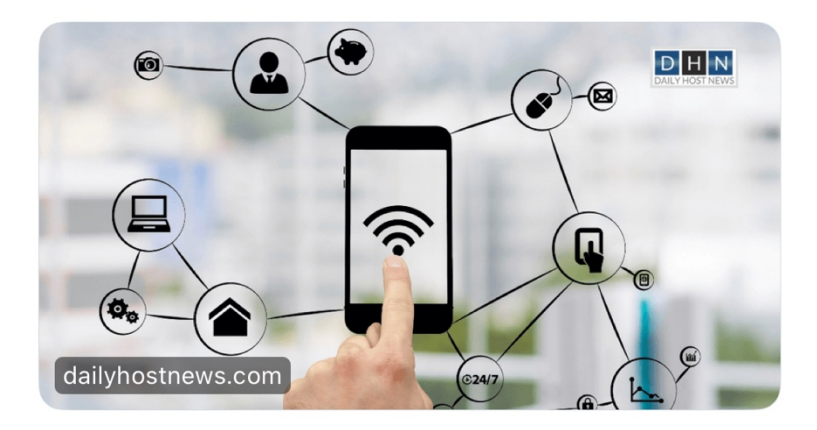
08:29 \cdot 14/11/2023 from Earth \cdot 9 Views

SmartCIC and TMR partner to accelerate fixed wireless adoption across North America bit.ly/ 3syiH5e #webhosting